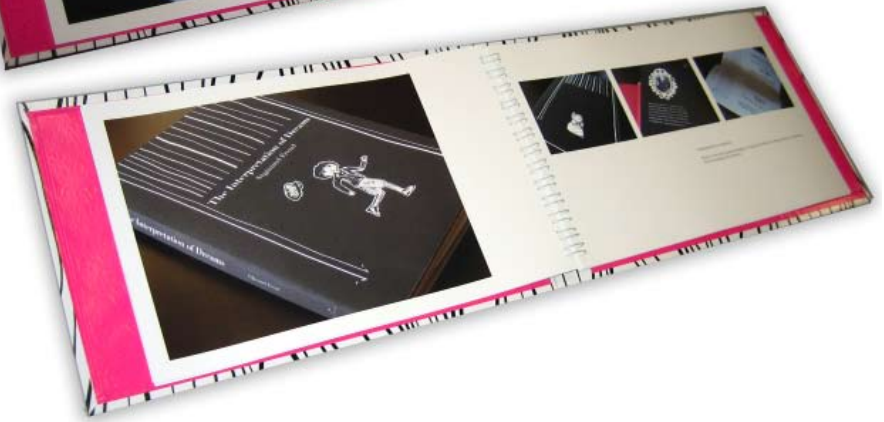
Website, Video, CD Packaging, and Book. Selected and Revised Portfolio Work.